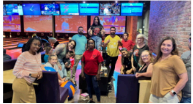
Deaf Hangout — May 21

It's that time again! Our next workshop is here. Come and enjoy the Self-Defense class that will be taught in ASL. All ages and skills are welcome! It will take place at Raw Iron Gym (3320 Troup Hwy Suite 160, Tyler.) Next to Roma's restaurant.