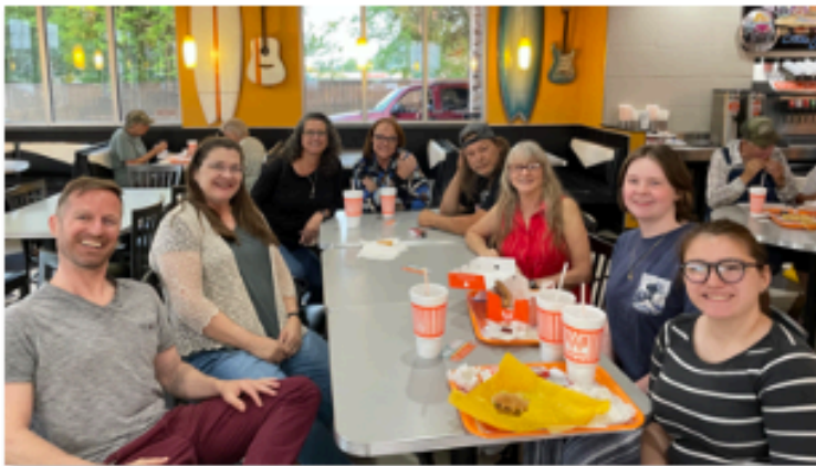
Lindale Deaf Chat — May 20

It's that time again! Our next workshop is here. Come and enjoy the Self-Defense class that will be taught in ASL. All ages and skills are welcome! It will take place at Raw Iron Gym (3320 Troup Hwy Suite 160, Tyler.) Next to Roma's restaurant.